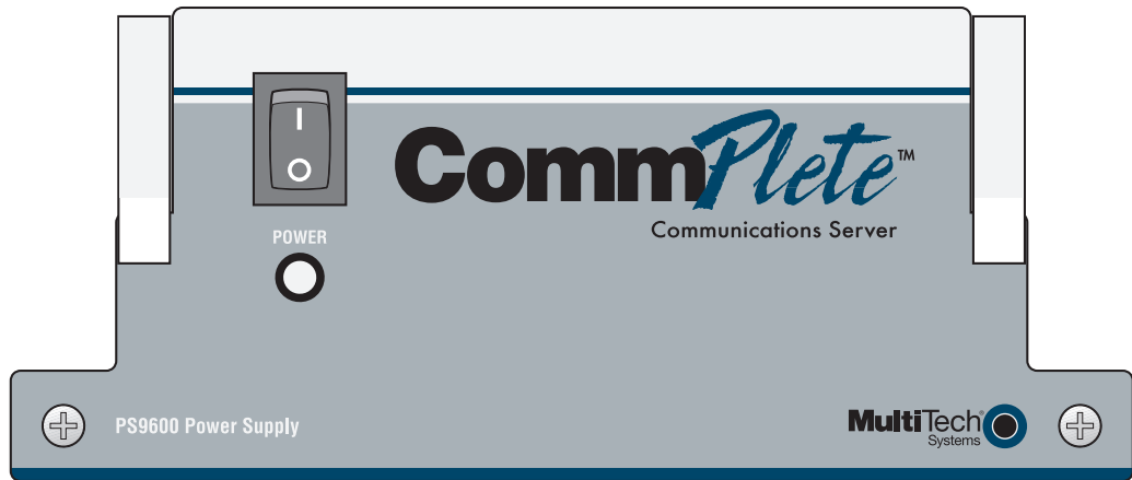
Figure 1. PS9600 power supply.

The PS9600 is a universal input switching power supply for the CommPlete Communications Server. Two PS9600 power supplies are installed as standard equipment in each CommPlete CC9600 chassis. The outputs of the two power supplies are connected in parallel to the CC9600 chassis power bus. If any of the outputs on either power supply fails or is too low, the other power supply takes over with no switchover time, and supplies all the power required to run the system. (This assumes that both power supplies are turned on.)